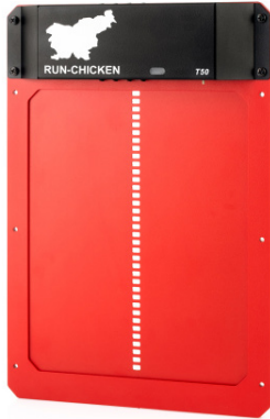
Rhode Island Red