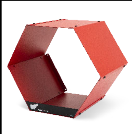
Rhode Island Red